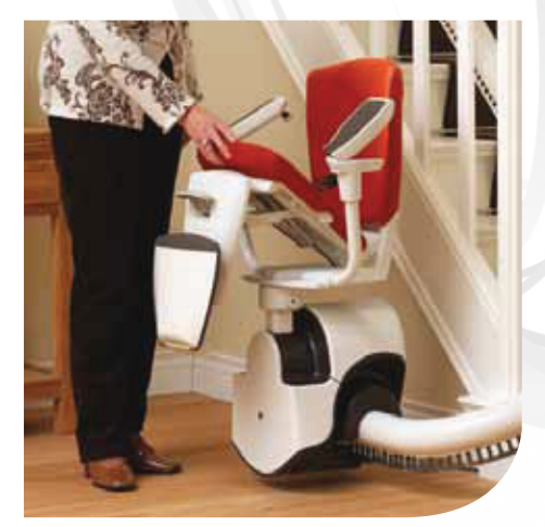
Effortless fold away in 1 easy step