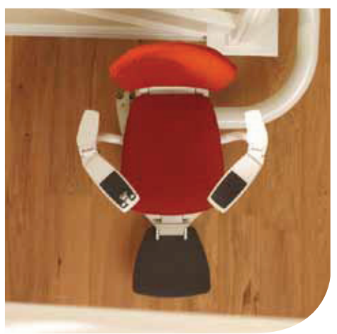
The comfort and added security of wrap-around arms