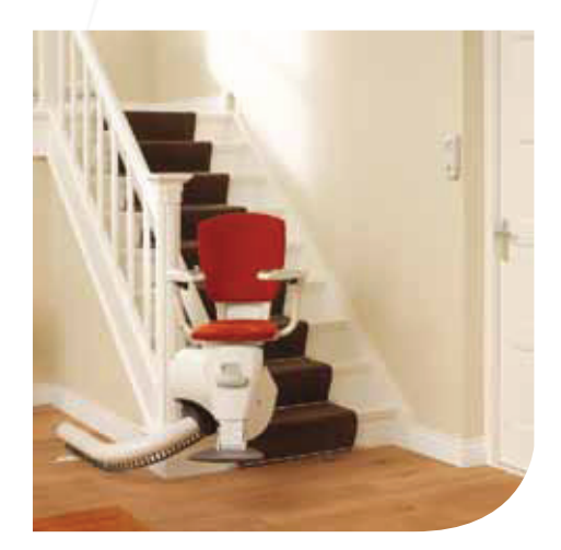
Wall mounted call and send controls deliver Flow to you by remote control